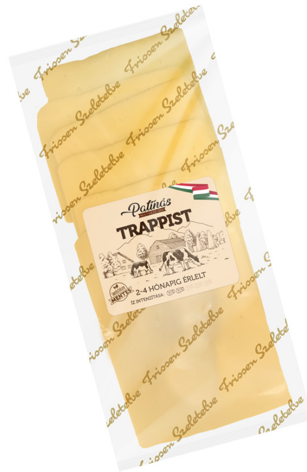
Single pack - 115g in mono carton