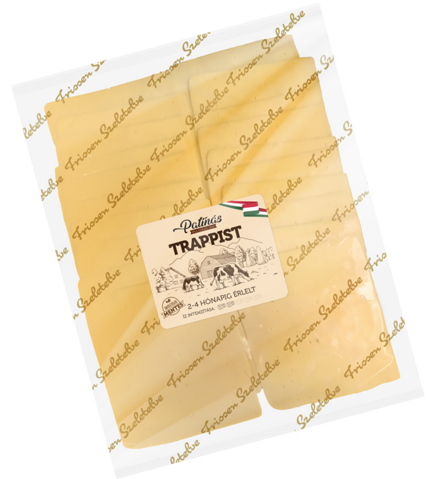
Family pack - ~300g in mono carton